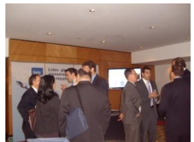
Networking Opportunities available throughout the day